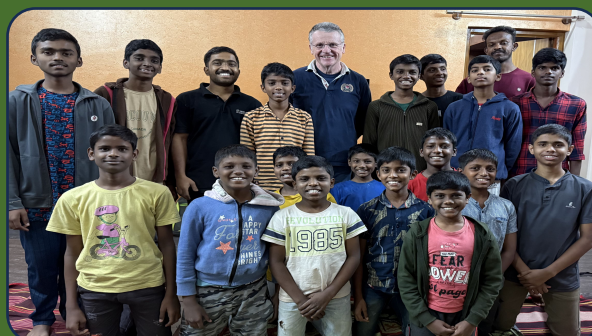
The boys in the Children's home